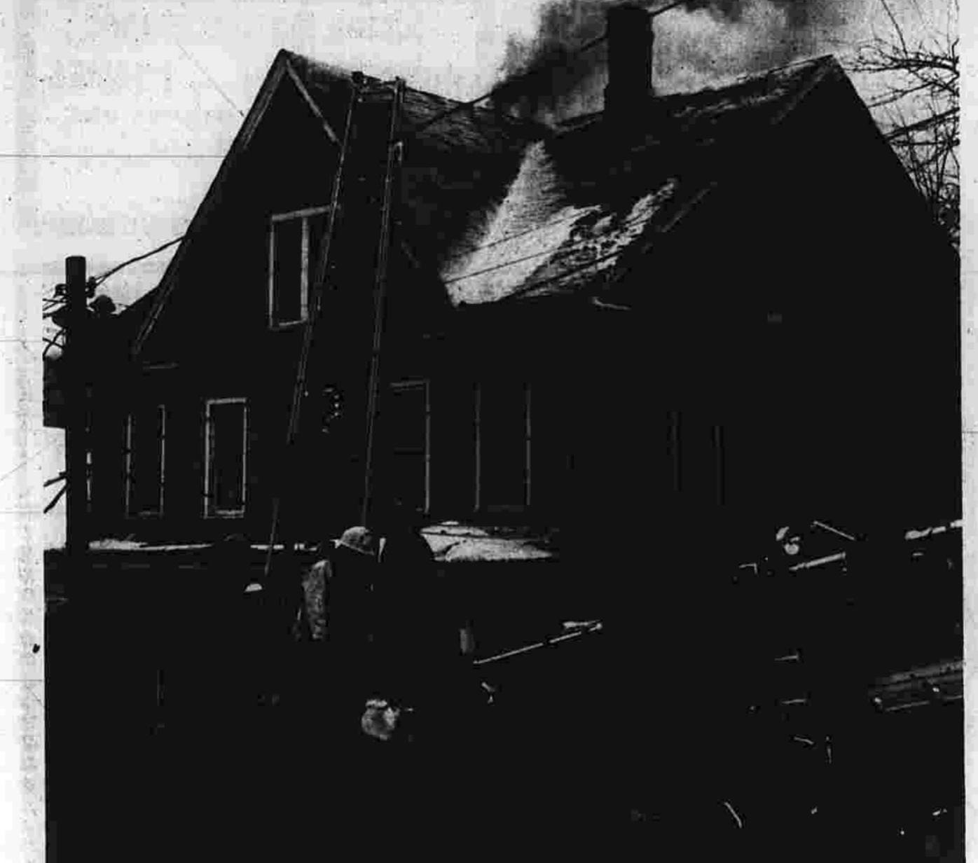
Firemen work to put out blaze at 11 Ward St., Rockville.