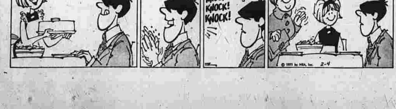
LANCLOI BY COKER AND PENN