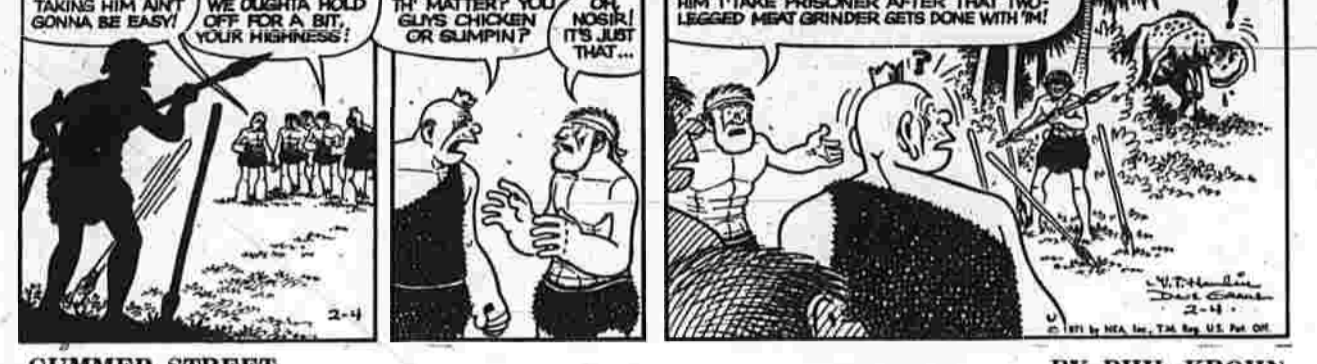
ALLEY OOP BY PHIL KROHN