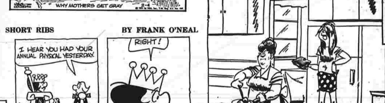
SHORT RIBS BY FRANK O'NEAL