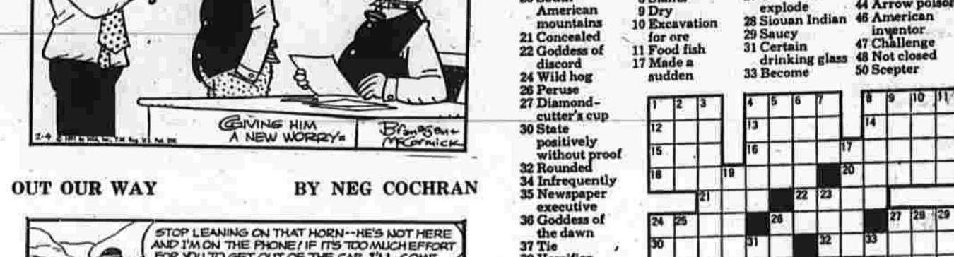
OUT OUR WAY BY NEG COCHRAN