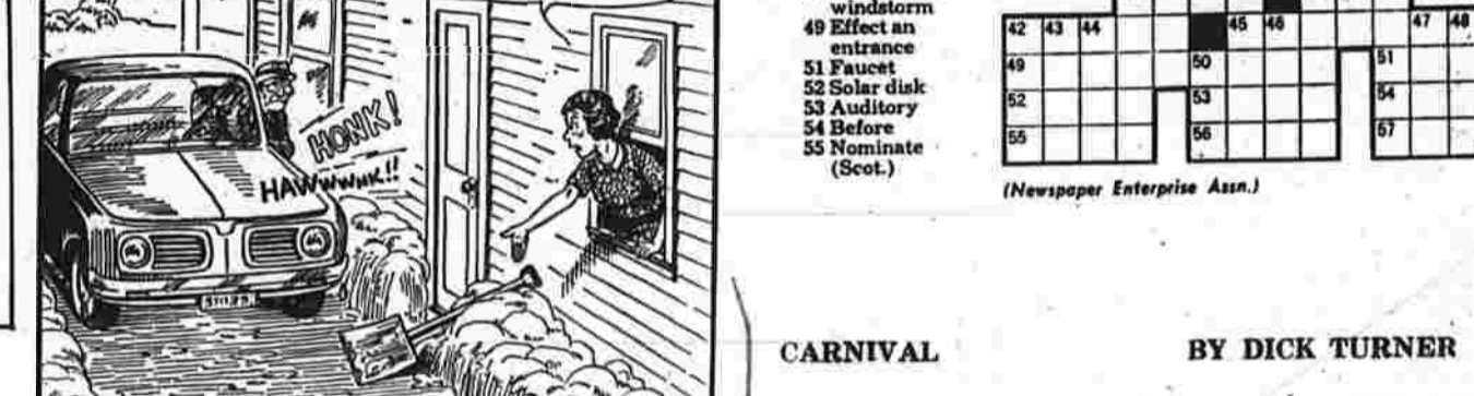
CARNIVAL BY DICK TURNER